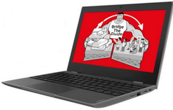
Lenovo WinBook 100e