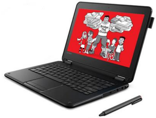
Lenovo WinBook 300e